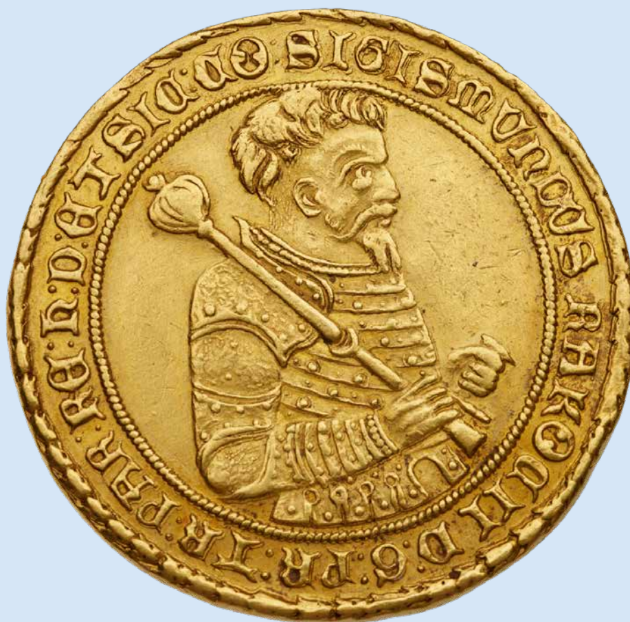
Sigismund Rákóczi Gold 10 Ducats 1607